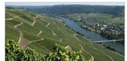
Steep vineyards along the Mosel river.

Today the Weingut Schmitges is one of the finest in the Middle Mosel. The wines show clean, refreshing fruit but for me it's their crisp acidity along with the pronounced mineral character that makes these wines stand out.