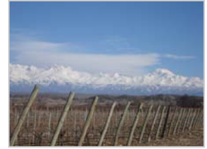
The snow-covered Andes and the Tupungato Mountain provide a scenic backdrop to the vineyards.

Tupungato area, along with many hectares of mature vineyards. Tupungato is a very special sub-region of Mendoza with vineyards planted at some of the highest altitudes in the region. The diurnal temperature swings can approach 50 degrees Fahrenheit during harvest time. These huge temperature swings allow for wines with intense ripeness to be combined with sappy freshness and firmer structures. The Gouguenheim winery produces two separate lines of wines in an effort to showcase the potential of the Tupungato region and the quality-price ratio is unrivaled.