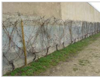
The ingenious wall training system used at Clos Cristal.