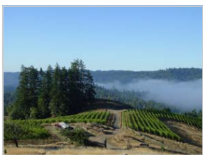
Spectacular view of the vineyards.