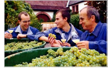
The Knipser bothers during harvest.

partly with gravel, on a limestone subsoil. The Knipsers are considered one of the top red wine houses of Germany, excelling with Pinot Noir, Cabernet, Merlot and Syrah. They also produce highly-rated white wines. The Knipsers make excellent dry Rieslings, but also cultivate other varietals such as Pinot Blanc, Pinot Gris, Chardonnay and Gewurztraminer.