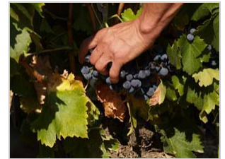
Ripe Grenache grapes.