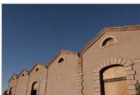
The winery fully restored in the traditional Adobo-style.

Bodega Benegas is one of the flagship properties in the Argentine wine industry. The Benegas-Lynch family was a pioneering force in Trapiche Vineyards, one of Argentina's oldest commercial wineries. They built their own winery in 1897 but were forced to sell the business in later generations. The current patriarch of the family, Federico Benegas-Lynch, repurchased the original family vineyard and winery building and has spared no expense to refurbish the building to its original grandeur and return Benegas to its former glory.